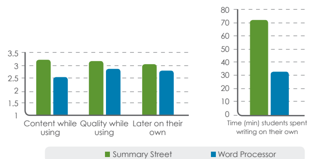
Figure 1. Summary Street produces better essays as judged by teachers in a two-week trial of sixth grade students.